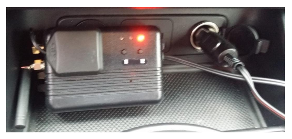
Without power supply, the unit is non-functional